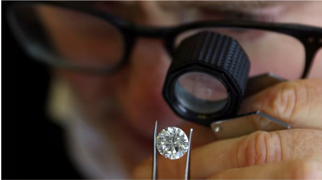
Diamonds are one of the few major Russian exports still untouched by EU sanctions imposed in response Russia's full-scale invasion of Ukraine last year