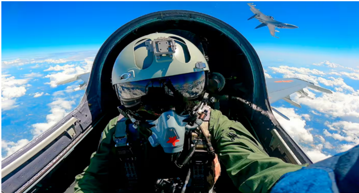
📷 Taiwan says Chinese aircraft crossing Taiwan Strait's median line included Su-30 and J-10 fighters, accompanying Chinese warships.

Taiwan has reported an escalation in Chinese military activity, with nine aircraft breaching the Taiwan Strait's median line. The incident follows the Biden-Xi talks during the APEC summit. While such activities were reduced during Xi's visit to San Francisco, the latest move underscores ongoing tensions between China and Taiwan. The aircraft, including Su-30 and J-10 fighters, were accompanied by warships engaged in "combat readiness patrols." Taiwan's defence ministry responded by monitoring the situation, emphasising China's persistent pressure on Taipei's sovereignty claims. As Taiwan gears up for elections, the island remains a central focus of US-China discussions.