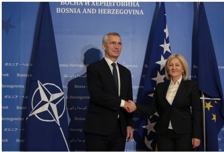
[1/3] NATO Secretary General Jens Stoltenberg shakes hands with Bosnian Prime Minister Borjana Krišto during his visit to Sarajevo, Bosnia and Herzegovina, November 20, 2023.