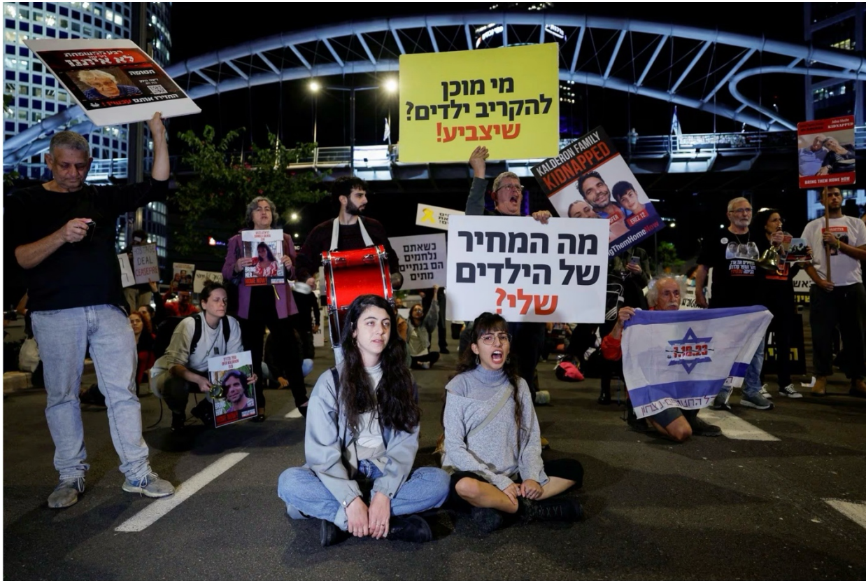
[1/7] People hold signs during a demonstration held to demand the liberation of hostages who are being held in the Gaza Strip after they were seized by Hamas gunmen on October 7, in Tel Aviv, Israel, November 21, 2023. REUTERS/Amir Cohen Acquire Licensing Rights