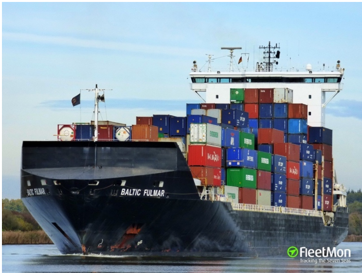
Photo of the Chinese Newnew Polar Bear container ship.