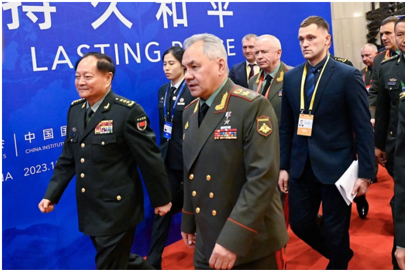
Chinese Vice Chairman of the Central Military Commission Zhang Youxia and Russian Defense Minister Sergei Shoigu arrive at the Xiangshan Forum in Beijing on Monday.