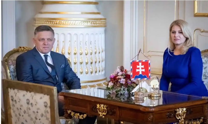
President Zuzana Caputova invites Smer party leader Robert Fico to try to form a new government. She is also suing him for defamation.