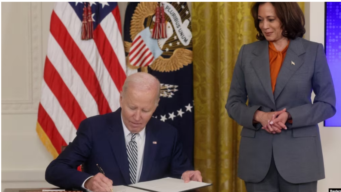
Photo of US President Joe Biden signs an Executive Order about Artificial Intelligence and Vice President Kamala Harris.

An executive order issued by US President Joe Biden mandates that technology companies working on artificial intelligence (AI) will create consumer protection guidelines. It also mandates that businesses test new AI tools before releasing them and share information with the US government. The order also requires the Department of Commerce to develop standards for AI-generated materials, such as watermarks. There are some controversies however that AI will only benefit specific groups of people and therefore, the order mandates that any application of AI will be according to civil rights laws to avoid discrimination in employment, housing, healthcare, and sentencing.