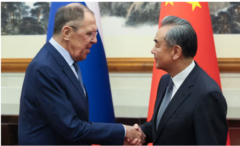
📷 The Russian foreign minister, Sergei Lavrov, met his Chinese counterpart, Wang Yi, in Beijing on Monday.

The ongoing conflict in Gaza has triggered heightened geopolitical tensions as China and Russia have recently strengthened their positions. Both nations have voiced concerns about the situation, with China calling for an immediate ceasefire and a peaceful resolution, while Russia has expressed support for a diplomatic solution. This development is notable for several reasons: it underscores the growing influence of China and Russia in the Middle East, challenges the United States' historical role in the region, and highlights the complex international dynamics surrounding the Israeli-Palestinian conflict. The actions of China and Russia are likely to have far-reaching implications, further complicating the path to a peaceful resolution in Gaza.