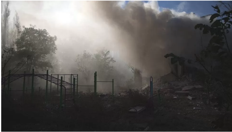
This photograph, posted by Zelensky on X, depicts a playground in Avdiivka, illustrating the aftermath of Russian air attacks.