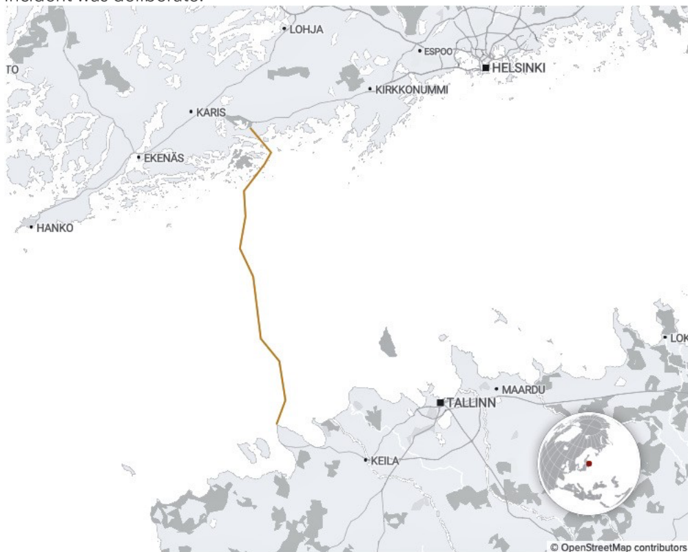
— Approximate Location of the Baltic Connector Pipeline

The Balticconnector gas pipeline, a vital infrastructural link between Finland and Estonia, was shut down on October 8th due to a sudden pressure drop, causing gas leakage. Subsequently, the Finnish government reported that the undersea infrastructure, encompassing both the gas pipeline and telecommunications cable, was damaged by outside activity. Initial investigation data suggests that a mechanical force caused the disruption. As this incident is seen as an attack on the country's infrastructure, Finnish intelligence has not ruled out the involvement of a state actor. NATO members have already pledged to respond if it's proven that the incident was deliberate.